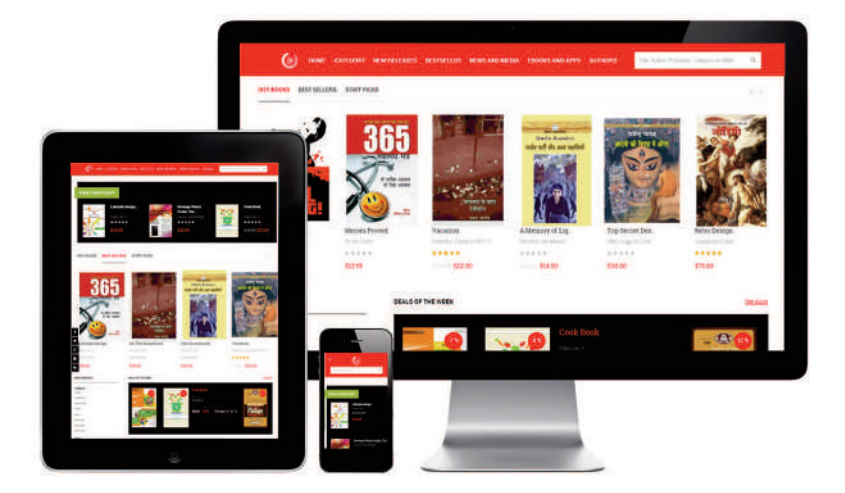
Responsive eStore on multiple browsers and devices

To extend the reach of books beyond their traditional print distribution network, Rajkamal is making all titles available in PDF and ePUB online at www.rajkamalprakashan.com. This gives customers the comfort of purchasing and reading digital books using the eReader on desktops and laptops.